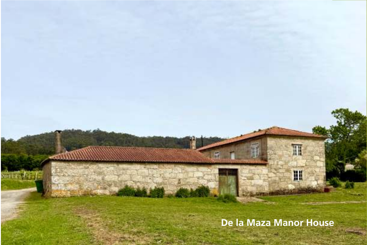
De la Maza Manor House