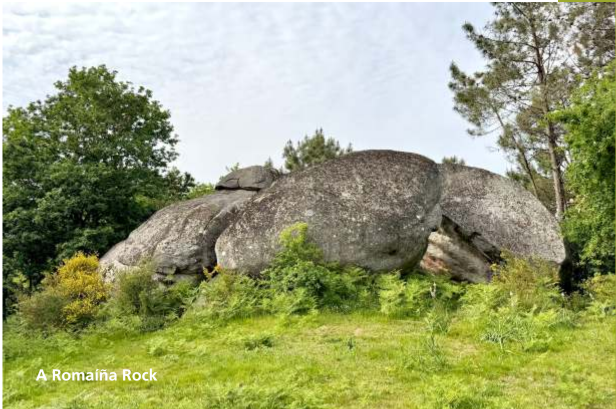
A Romaiña Rock

c/ General Lacy, 3 - 1-1ºB 28045 Madrid 91 435 31 47 adeac.es info@senderosazules.org